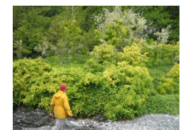
Invasive ivy takes over an islet off the coast of Tofino, British Columbia, Canada. 2009.