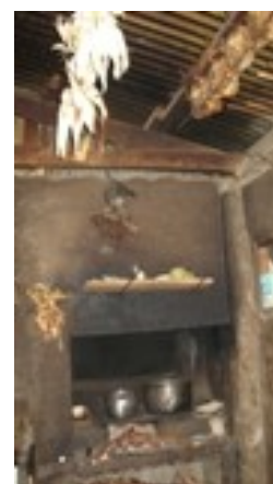
Typical fireplace use for drying seeds.