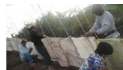
Fencing the garden to protect it from animals.