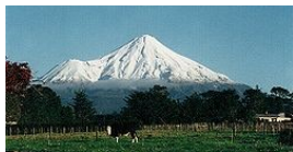
View of Mount Taranaki or Mount Egmont from Stratford, facing west. Fanthams Peak is to the left of the main peak.

“the Snowchange Cooperative will work to foster knowledge exchange and educational exchanges between northern and southern Indigenous groups”