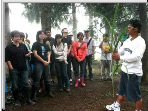
Kalibuan villagers illustrate rituals before hunting.