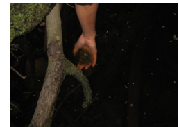
Northwestern salamander ( Ambystoma gracile ) egg sack, 2009.

Click here for more information on submission of abstracts and papers, and on the Congress publication and refer to the SOLAE website for more general information: www.solaetnobiologia.org/