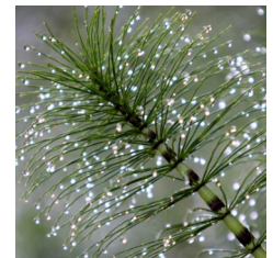
Dew drops on Giant horsetail or Scouring rush ( Equisetum arvense). 2009.

If you are interested, please contact the ISE Co-ordinator at: isecoordinator@gmail.com