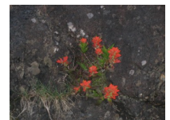
Paintbrush ( Castilleja coccinea ) 2009.