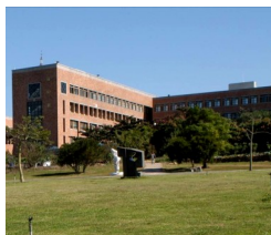
Research Center for Austronesian Peoples, Providence University, Taiwan.

Indigenous tribes in Taiwan refer to the earliest arrivals that have inhabited Taiwan long before the immigration of Han people from mainland China. Indigenous people in Taiwan, for this reason, also belong to a branch of Austronesian. Recently, linguistics, archeologists, and cultural anthropologist have successively discovered that Indigenous activities in Taiwan have endured for up to several thousand or even over ten thousand years.