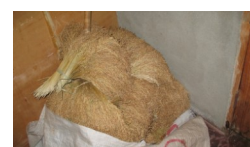
Harvested rice ready for drying.