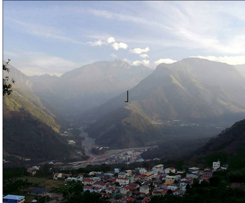
Overlooking the Kalibuan Tribe of Tongku Saveq.