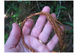
Cedar bark ( Thuja plicata) used for twine. 2009.