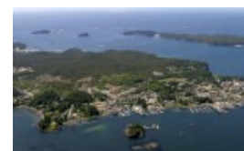
Aerial photo of Tofino, looking southwest out on the Pacific Ocean.

and Congress Organizer Josie Osborne, and treated to a garden walk through the tangled candelabra cedars to the shore of Clayoquot Sound and the Tofino mudflats, followed by a lovely northern shrimp supper at the Darwin Cafe in the Garden before getting down to formal discussions of the upcoming Congress.