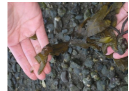
Rockweed ( Fucus distichus ). 2009.